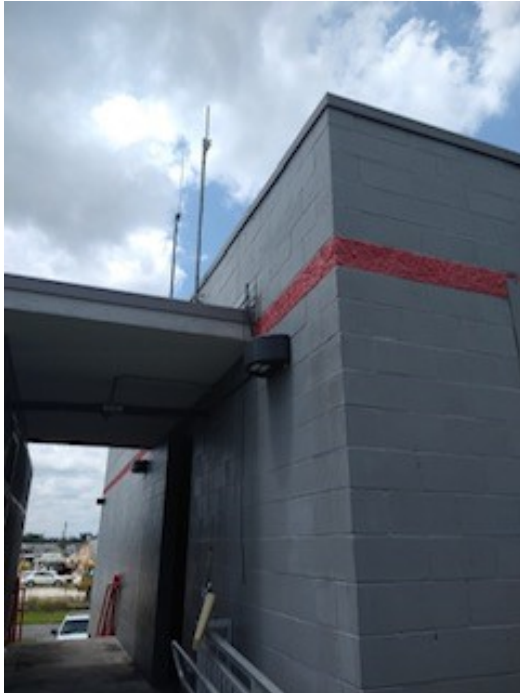
Safe Room – Antenna Pole