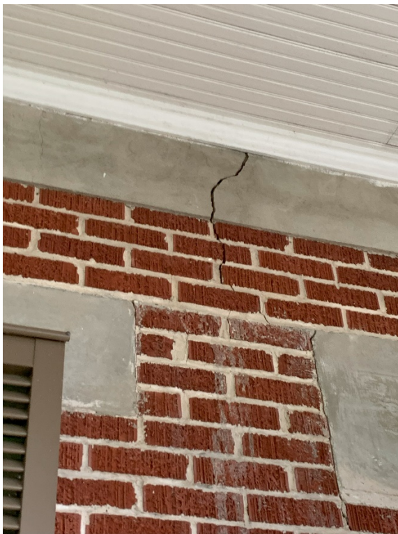
Central Station – Exterior Masonry and Cast Stone Cracking