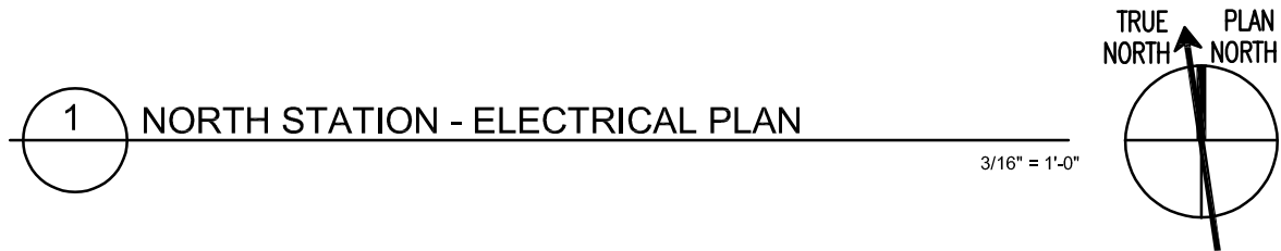
1 NORTH STATION - ELECTRICAL PLAN