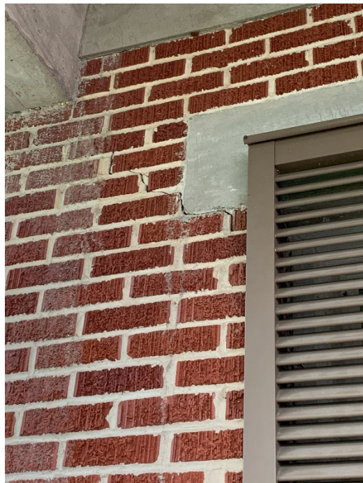
Central Station – Exterior Masonry Cracking