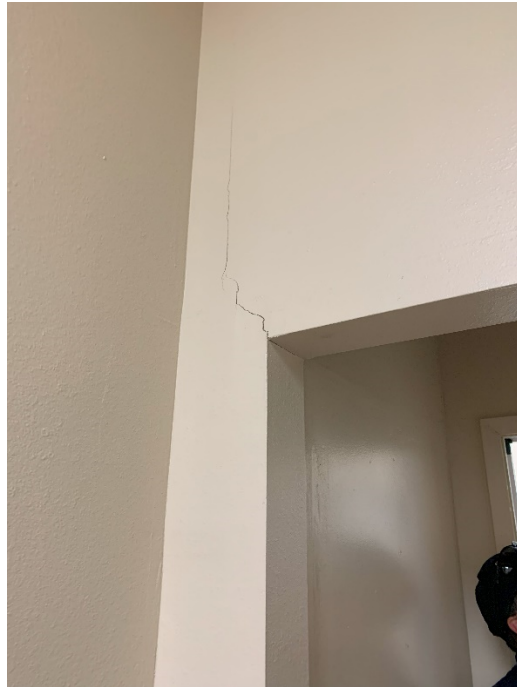
Central Station – Interior Surface Cracking