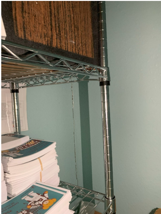
Central Station – Interior Surface Cracking