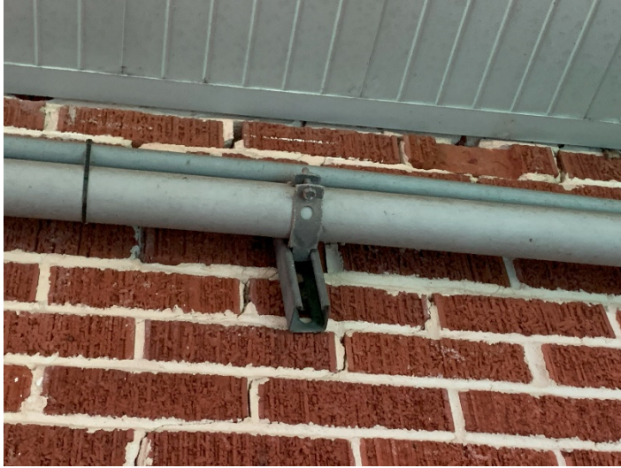
Central Station – Exterior Masonry Cracking